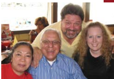
Candlelight Service and Volunteer Luncheon