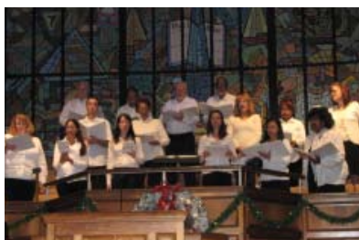
Christmas Time at Founder’s

On this occasion of our Golden Jubilee, the consciousness of Founder’s and our movement, the Centers for Spiritual Living, have stuck gold.